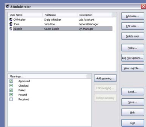
The User Administration Package administrator has the ability to create new users, create signature meanings and assign meanings to individual users.